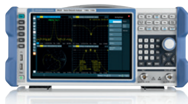
R&S®ZNL6 6 GHz 3-in-1 vector network analyzer 15 % discount