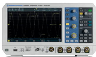
R&S®RTM3000 500 MHz oscilloscope 51 % discount