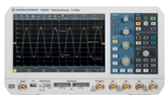
R&S®RTB2000 300 MHz oscilloscope 43 % discount