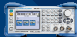
R&S®SMC100A 3.2 GHz signal generator 10 % discount